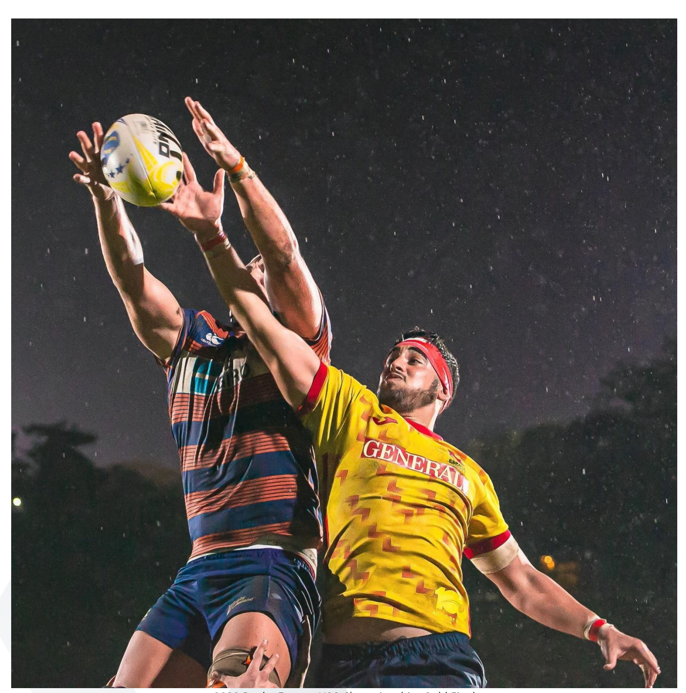
2022 Rugby Europe U20 Championship, Gold Final