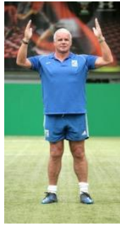
Front on view

Call for Match Day Medical Team including the resuscitation doctor for assistance with any suspected SPINAL INJURY