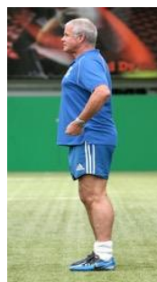
Side on view