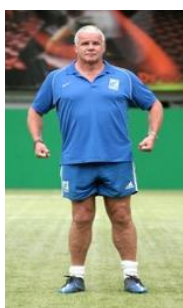
Front on view