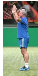
Side on view